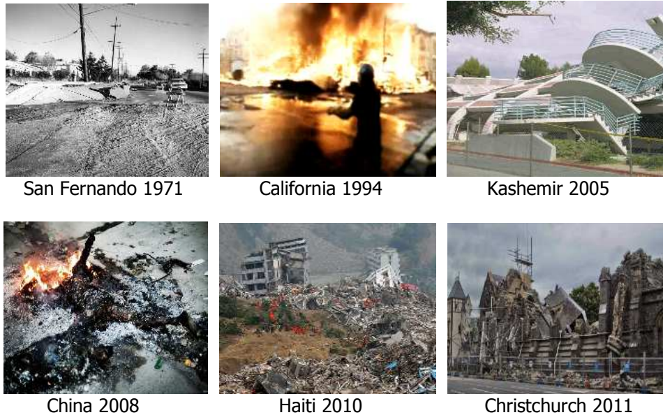
Figure 1. Seismic disasters over the years

caused by short circuit of electrical equipment, fires and explosions caused by damage to natural gas supply pipes [4].