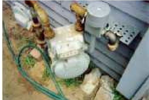
Figure 4. Automatic device (valve) to stop natural gas supplies [34]

The movement of structural and nonstructural elements with high massiveness produces the separation / detachment of pipes clamping elements that can or brake damage to that may cause the pipes damage or break. For this reason, measures are required to avoid IU- CNG full or partial exit from operation by interrupting the connections with external supply networks. Overall, IU-CNG pipeline rupture generates fire and / or explosion. Thus, in order to automatically interrupt the gas supply in buildings with high fire danger is recommended installing automated devices for interrupting the gas supply (Figure 4) in the supply grid. For buildings with low fire danger, there can be use manually operated closure devices [34].